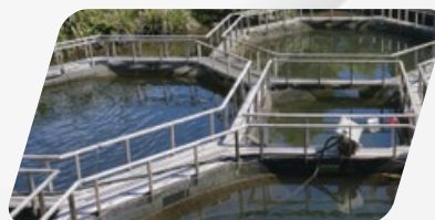
Fish pond drainage and irrigation