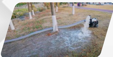
Well water lifting